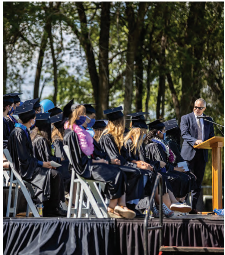
Students and close family celebrated graduation outside this year, with social distancing practices in place.